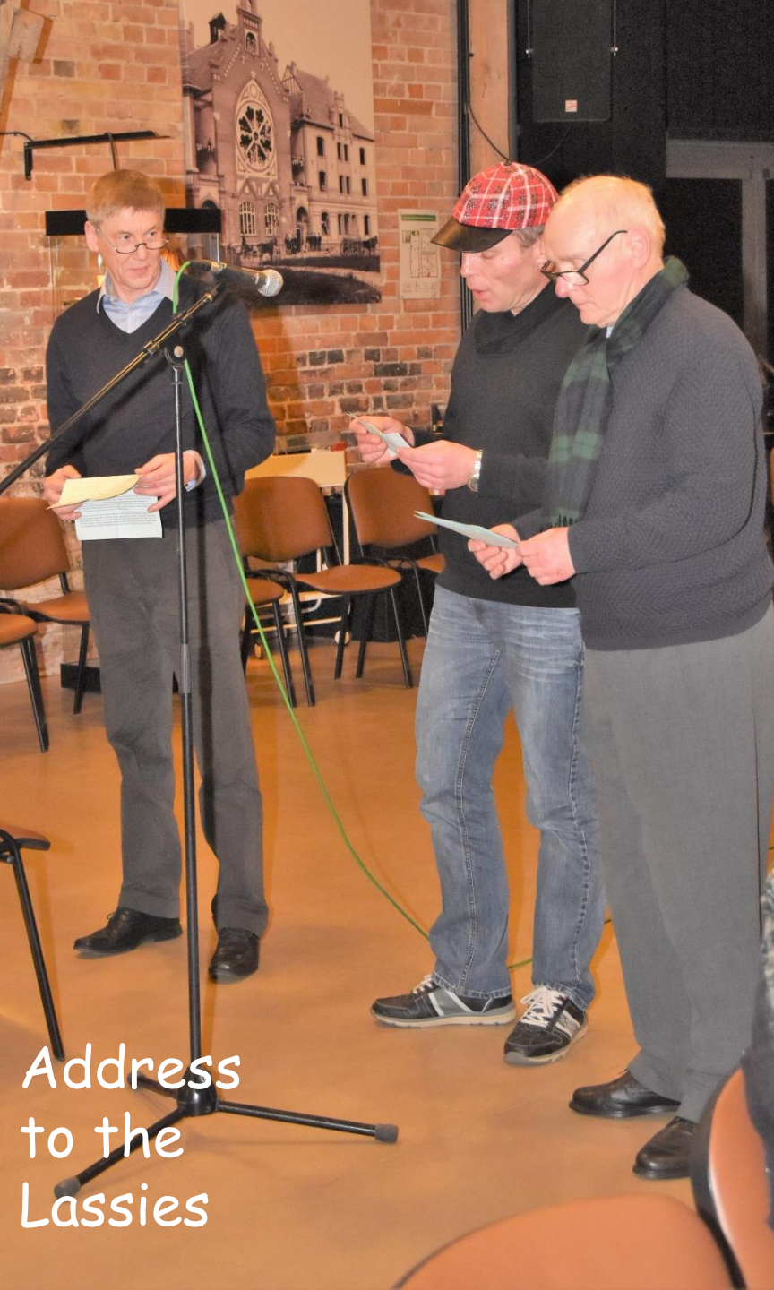
Address to the Lassies