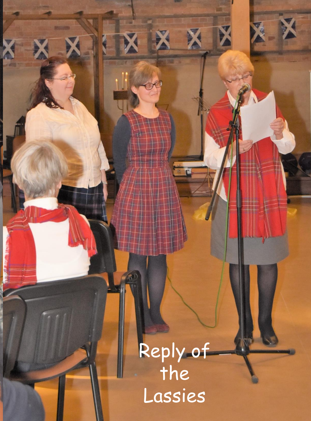
Reply of the Lassies